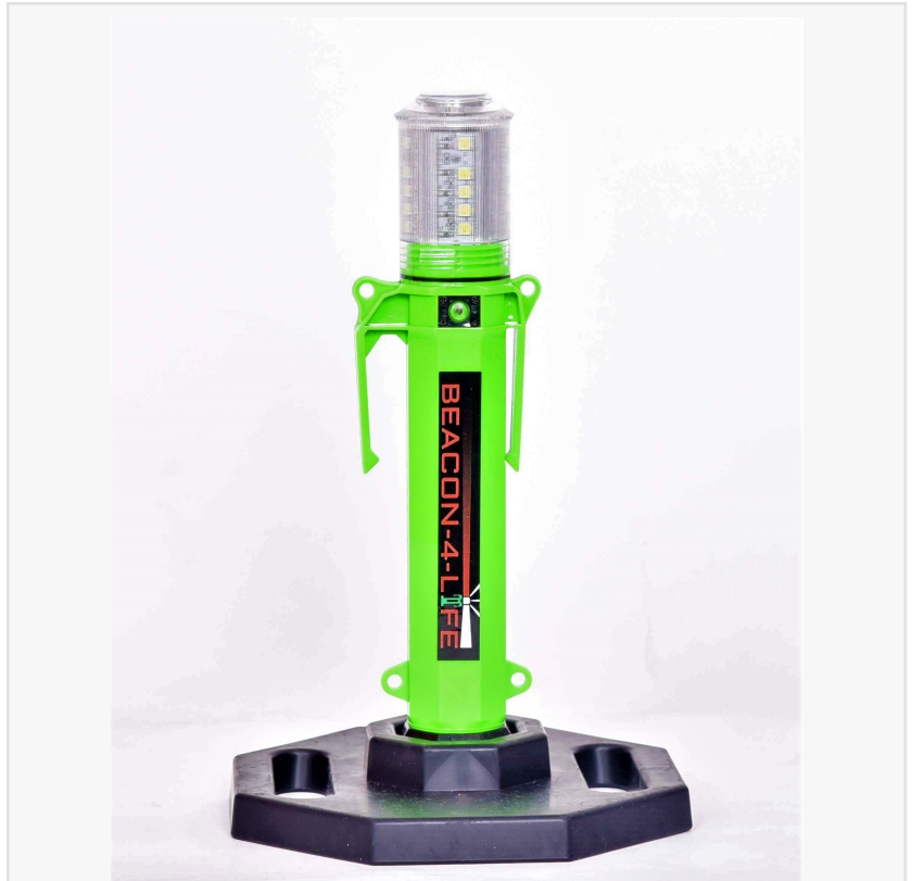
BEACON-4-LIFE with removable rubber base plate