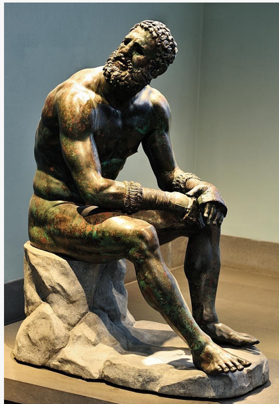
The Boxer Resting - Greek Statue circa.330-50 BC