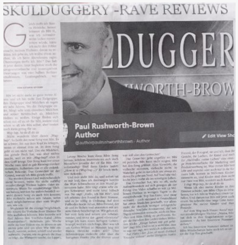
US National Times