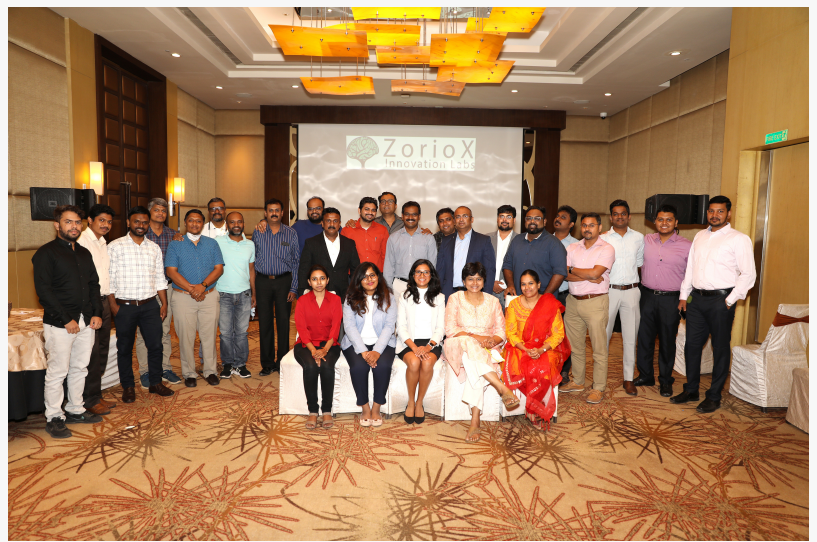
Group of Surgeons and Technical Specialist

The advent of 3D printing technology, biocompatible titanium, medical designing tools along with virtual surgical platforms, has revolutionised the field of facial reconstructive surgery. The