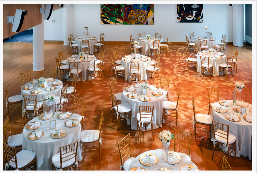
Flexible space allows for diverse event setups

HSA is now a modern version of what founder Dorothy Maynor once described as "the gathering place". Gone is the brick façade – replaced by a cutting-edge, angled glass curtain wall that allows a full transparent view inside and provides excellent acoustics.