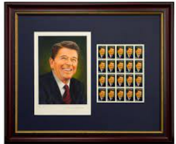
Ronald Reagan Commemorative Products Buyers Mailing List

The Story Of Sprint Data Solutions Worldwide A disabled veteran first conceived sprint Data Solutions Worldwide Marketing. After completing the responsibilities of military service, the next step was to move from defense to economic growth, helping businesses to find the clients and customers so essential to increasing revenue. A small start-up was formed that eventually grew into the company it is today, with a staff with over 50 years of combined industry experience in the marketing