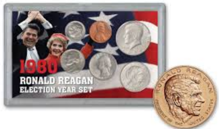
Ronald Reagan Election Complete Coin Set Buyers Mailing List