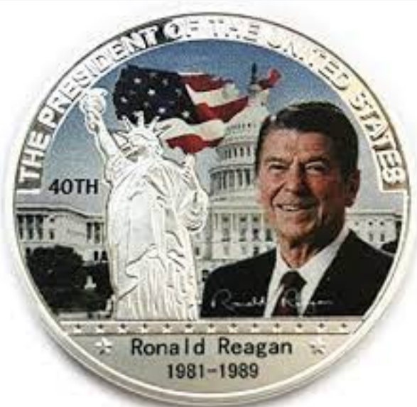
Ronald Reagan Commemorative Coin Buyers Mailing List