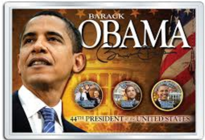
Obama Commemorative Plaque Buyers Mailing List

While the Obama administration wasn't, comparatively speaking, all that long ago, it is already shaping up to be a distinct period within recent American history. The start of the 21st century was marked by the tragedy of 9/11 for America and followed up subsequently by wars and