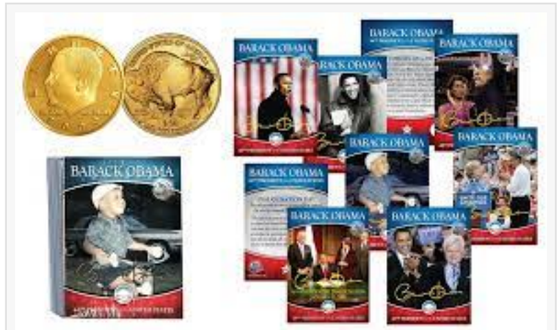
Obama Commemorative Products Buyers Of the Nation Mailing List

Marketing was founded by a disabled veteran with an idea. After completing the responsibilities of national defense, the next step was growth, both professionally and for the American