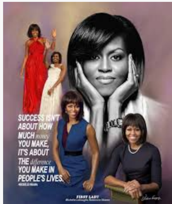
Obama Family Commemorative Product Buyers Mailing List