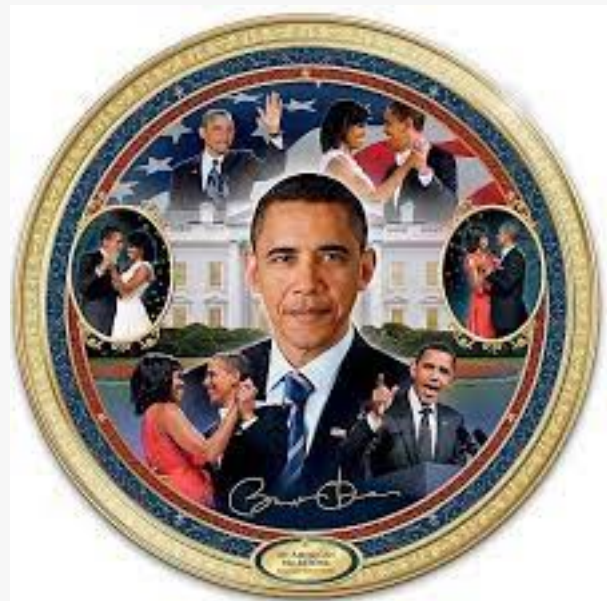
Obama Commemorative Coin Set Buyers Mailing List