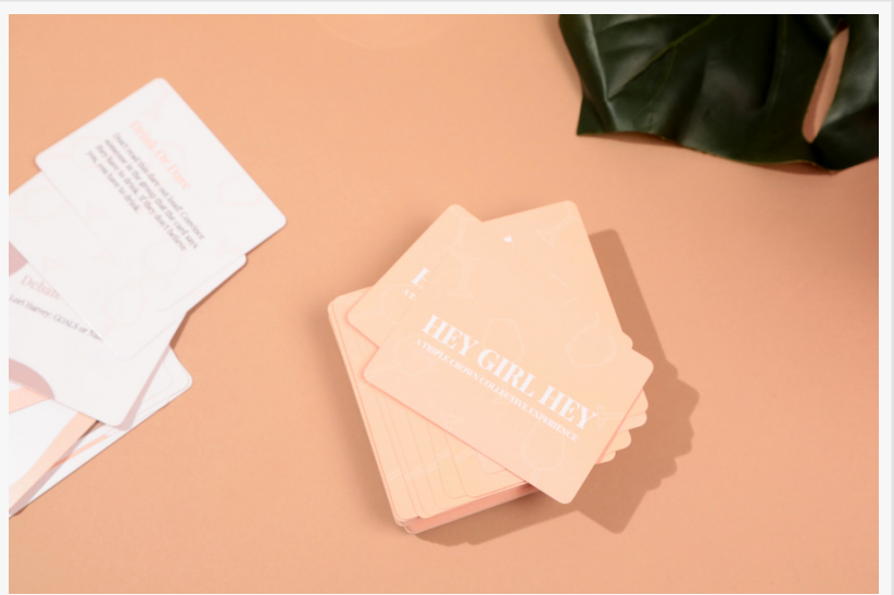
Hey Girl Hey Social Card Game

Hey Girl Hey does just that with its various questions and challenges. The game has five categories of prompts: Truth, Dare, Drink, Challenge and Never Have I Ever. Through engaging with the prompts, friends get to know more about each other and enjoy a few laughs along the way. The game fits easily into a purse or bag to tote it along to a lunch, brunch or night out on the town with friends.