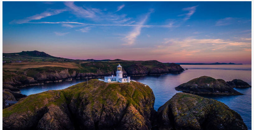
Strumble Head Light House

LONDON, UNITED KINGDOM, March 8, 2022 /EINPresswire.com/ -- Global travel authority Rough Guides has collaborated with Visit Wales to bring travellers the best responsible travel activities in Wales. The Rough Guide to Responsible Wales is now available as a free eBook to download on the Rough Guides website .