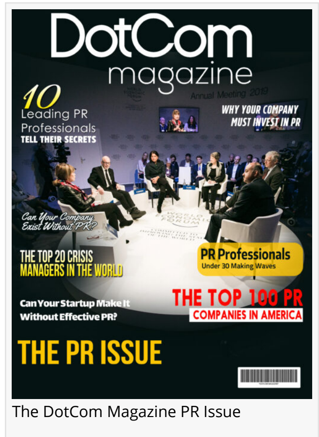
The DotCom Magazine PR Issue

© 1995-2022 IPD Group, Inc. All Right Reserved.