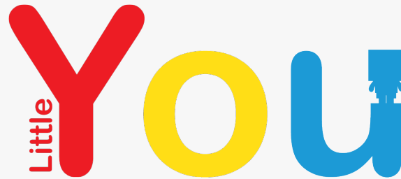
Little You 3D Logo

This press release can be viewed online at: https://www.einpresswire.com/article/565017592