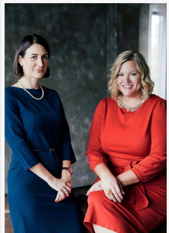
Founders of Whitmire & Munoz LLC

This press release can be viewed online at: https://www.einpresswire.com/article/565018069