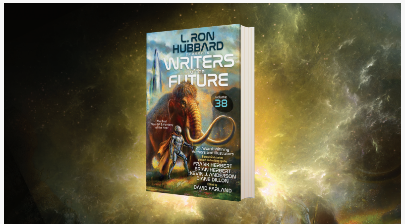
L. Ron Hubbard Presents Writers of the Future Volume 38