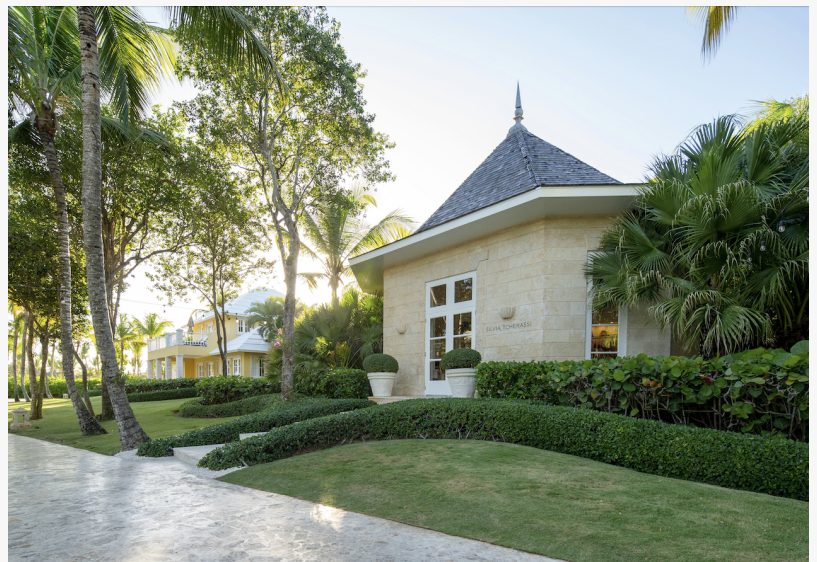
Silvia Tcherassi Boutique - Tortuga Bay Puntacana Resort & Club