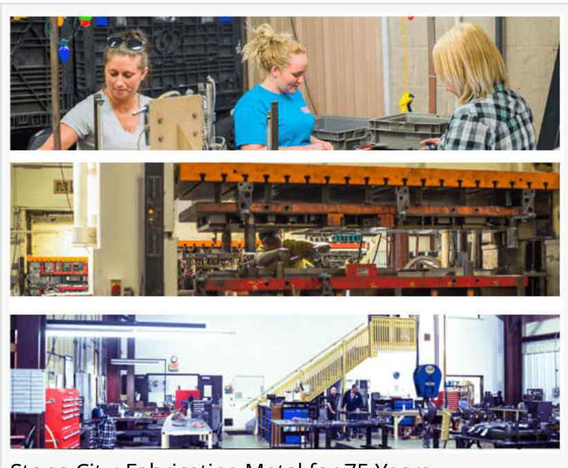
Stone City: Fabricating Metal for 75 Years

Stone City was founded in December of 1946, under the name "Stone City Machine and Tool." It began its life as a family-owned small business with annual earnings of less than 1 million dollars per year. After several decades