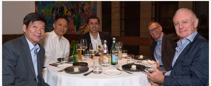
Dinner and Deals – Globalscope partners from across the globe gathered in Delhi, India to collaborate on potential transactions and renew old friendships.

This press release can be viewed online at: https://www.einpresswire.com/article/565143898