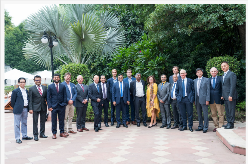
Globalscope Partners from around the world gather twice annually to discuss potential M&A transactions.