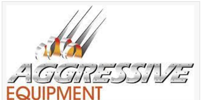
Aggressive Equipment Co. Logo