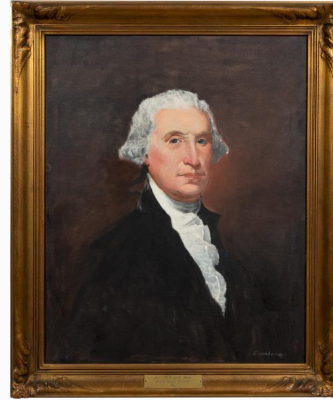
Former President Dwight D. Eisenhower's Portrait of George Washington, after Gilbert Stuart (Mass., 1755-1828) signed lower left, with a dedication plaque on the frame ($50,000).

Other noteworthy lots included an early 20th century Black, Starr and Frost Art Deco vanity case (or compact), made from 14kt yellow and white gold, rose cut diamonds, jadeite jade, enamel