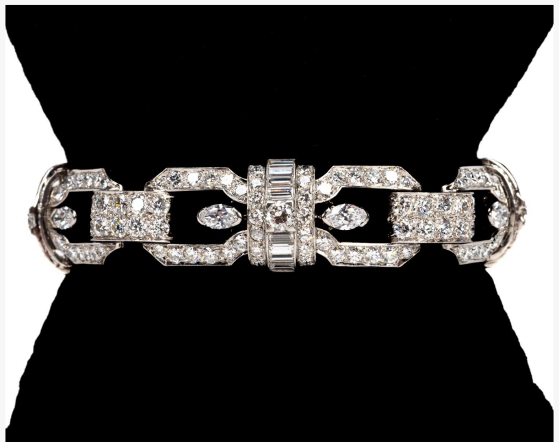
Circa 1920s Tiffany & Company custom Art Deco platinum and diamond bracelet comprised 20 ctw old European cut, modern cut and various cut diamonds, H-I color, VS-clarity ($112,500).