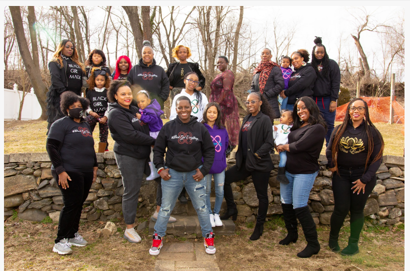
Black Girl Everything, LLC Collective

They strive to promote, support, and collaborate alongside the brands featured on their vlogs. They also help other brands connect with one another through pop-up shops in key areas in the U.S. The organization hosts annual retreats that allow black and brown entrepreneurs to take a break from their business and take a moment to pour back into themselves. Black Girl Everything, LLC provides scholarships to young ladies who aspire to become entrepreneurs.