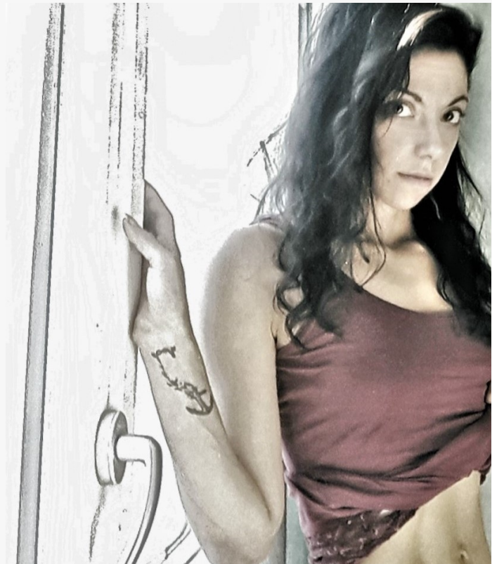
TOMORROW DEATH DIED OUT is Sima B. Moussavian's 5th novel in English

The German edition of the dystopia went live almost at the same time as the English publication.