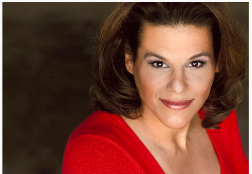
Award-winning Trans actor and activist Alexandra Billings from "Transparent" takes the stage to talk about her emotional and funny memoir "This Time for Me."

On Tuesday, May 3, bestselling author, "Family Guy" writer and HBO star Gary Janetti talks to SNL alum Casey Wilson about "Start Without Me (I'll Be There in a Minute)," his collection of hilarious and true life stories about the small moments that add up to a big life. Wilson was last seen in Showtime's "Black Monday" and Apple TV+'s "The Shrink Next Door."