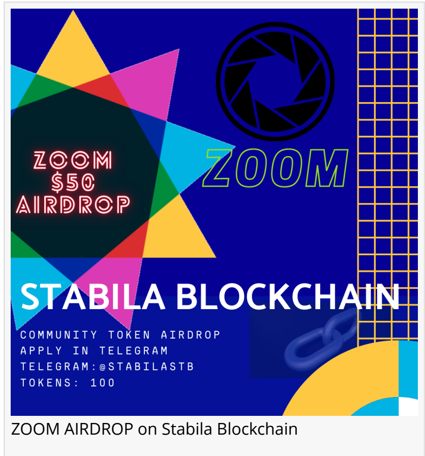
ZOOM AIRDROP on Stabila Blockchain

Stabila FINANCIAL Space will address the shortcomings of current FINANCIAL marketplaces and