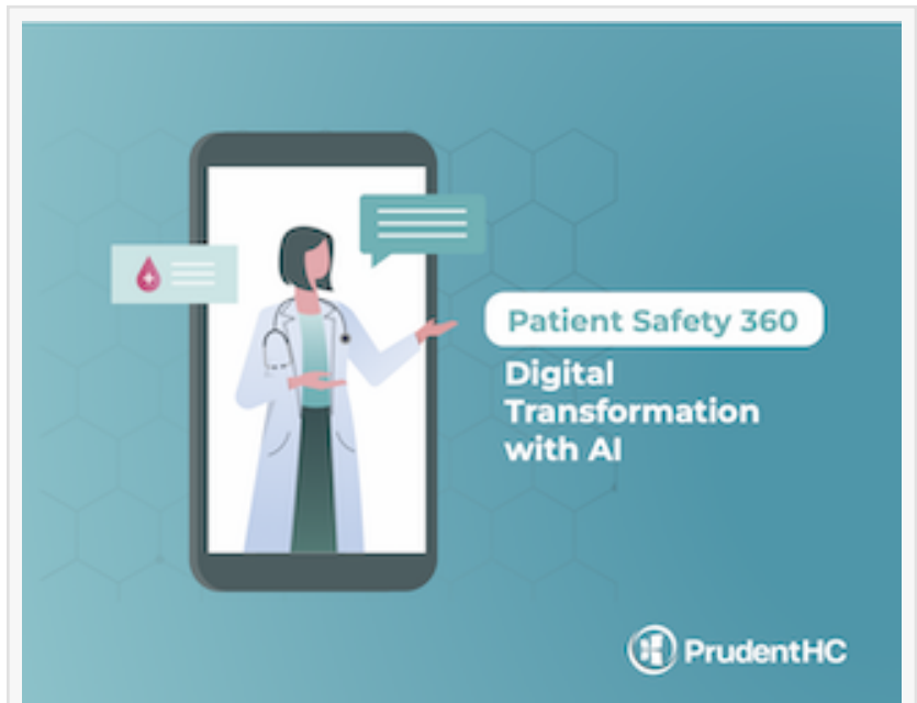
Patient Safety AI Prudent

Patient Safety 360 is a comprehensive healthcare adverse event management solution built to improve patient safety and reduce potential harm. In addition to modules such as event reporting, root cause analysis, and clinical risks management, PS360 includes an integrated AI