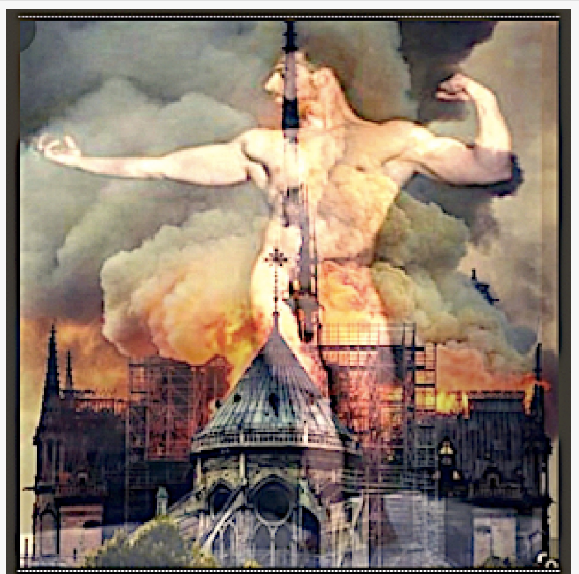
3D motion Graphics NFT experience design brand logos from MBF-Lifestyle East Coast

With The Fourth Turning we are in for the next few years (2027-2030) it is providing us with massive transformation ascending to a zenith point at a fast rate.