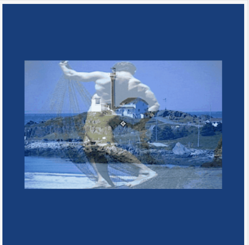
Cap Forchu Nova Scotia NFT experience design brand logos from MBF-Lifestyle East Coast

many artists lack the technical knowledge necessary for creating NFTs; however, tech-savvy developers are making it easier and easier to get started.