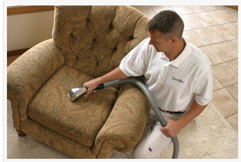
Chem-Dry Technician cleaning chair

to Thailand. We have found great success with many services, such as cleaning offices, area rugs, furniture, mattresses and even boat and car upholstery! And there are so many more incredibly valuable Chem-Dry offerings, such as the new disinfecting line, the tile and stone care, and the wood floor care that will do really well here. There is plenty of room for growth in Bangkok alone, and the smaller markets are screaming for these types of services."