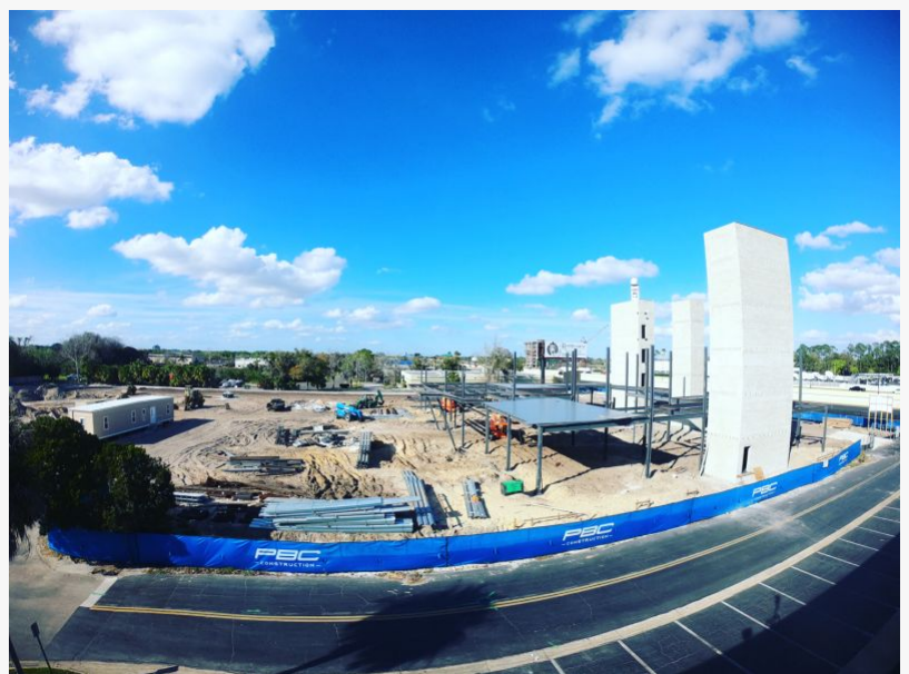
Progress Update: Vertical Construction Phase for PBC's $12m ORRA headquarters

– Begins Vertical Construction on New Headquarters Office Adjacent to Interstate 4 –