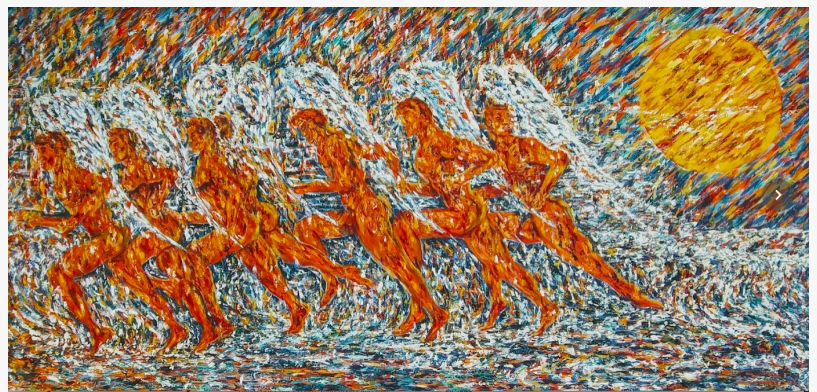
Seven Seafarers of the Seven Seas