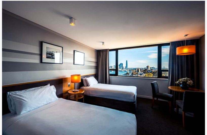
Fantastic views from View Hotels Sydney