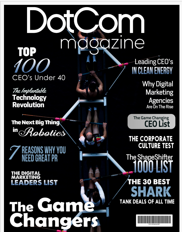
The DotCom Magazine Game Changers Edition

DotCom Magazine is a leading news platform providing fascinating interviews with news makers, thought leaders, and entrepreneurs. DotCom Magazine is the leader in putting people with insatiable entrepreneurial spirit at the forefront of every story it covers. The Entrepreneur Spotlight Interview Video Series looks at business through the lens of a successful entrepreneur's mindset. The Entrepreneur Spotlight Series has included