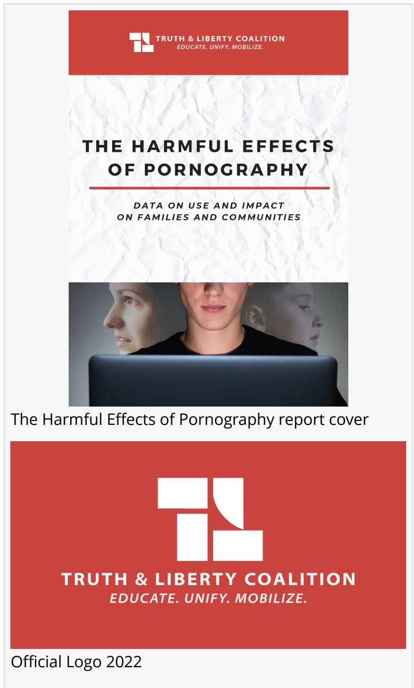
The Harmful Effects of Pornography report cover

Media Relations Truth & Liberty Coalition