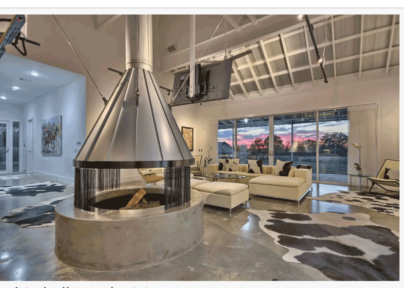
Whitehall Ranch Living Room

Inspiration and brilliant architecture were combined to create this residential environment. Tucked away on a natural hill surrounded by dense woods sit the main house, a two-suite guest house, a four-suite bunk house, and a pool house with spa. The simple contemporary lines of these luxurious tranquil residences offer total privacy, and the main house has huge