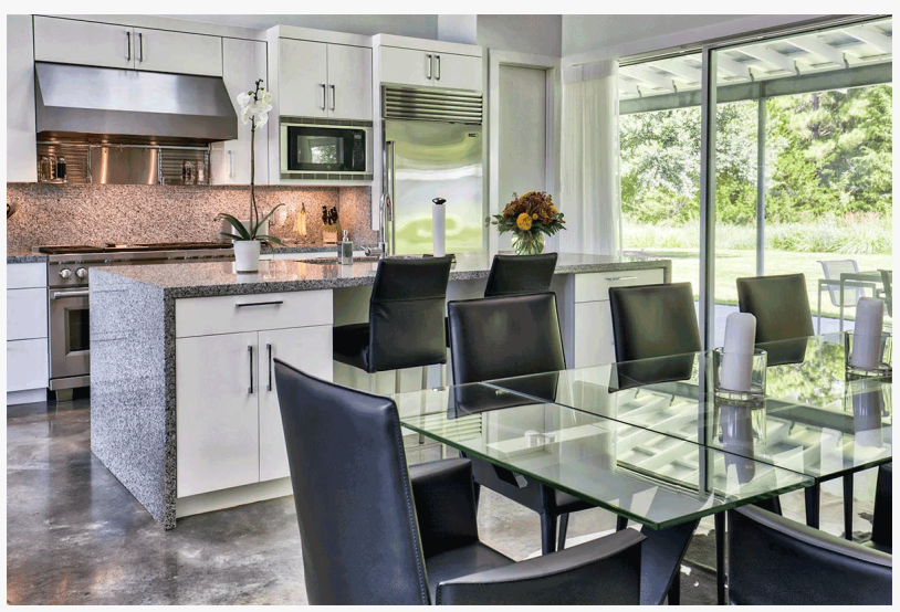
Whitehall Ranch Kitchen