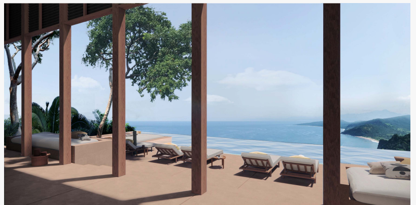
Access to incredible world-class resort amenities