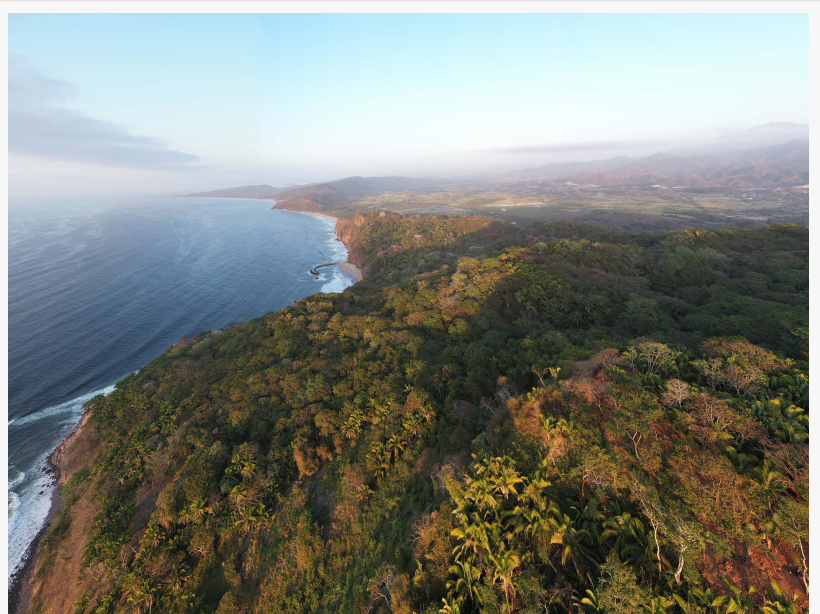
800 feet above sea level with unobstructed ocean views

protected for generations to come. Right next door is the upcoming world-famous Rosewood Hotel & Resort, known for its five-star amenities. With some of the world's best climate conditions expected year-round, every day will feel like paradise. Quiet coastal towns pepper neighboring shores, with busier tourist destinations close enough to enjoy without impacting one's privacy. The surfer's paradise of Sayulita beckons with some of the Pacific Coast's best breaks, and authentic shopping and dining are in nearby San Pancho. Direct 2- to 3-hour flights from the Southern United States and many additional North American cities to the Puerto Vallarta airport ensure one is never far from this idyllic haven.