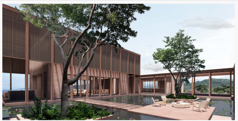
Design opportunities to fit your taste

The tranquil white-sand shores of Mexico's Riviera Nayarit stretch out endlessly towards the horizon. Light dances across blue waves from sunrise to sunset, with El Nido in the perfect position to admire its spectacular natural surroundings. The soaring mountain peaks, lush tropical rainforest, and rolling green flatlands of Mandarina are each honored and elevated by the resort's meticulous design. Thousands of federally protected acres within the Sierra del Vallejo Mountains ensure the existing views and privacy will remain both unobstructed and