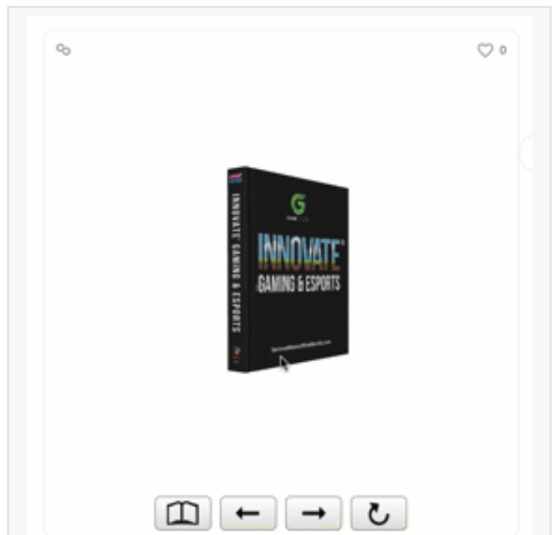
GIF Showing the INNOVATE® Gaming & Esports NFT Interactivity

Global Village will select 60 projects to feature based on polls and votes by the community. That will make up 40% of the 300-page book with the rest of the available spaces in the book randomly assigned to holders of the 2021 NFT Yearbook NFTs. The randomly assigned spaces will include front cover images, back cover images, thought leader pages, gallery spaces, etc.