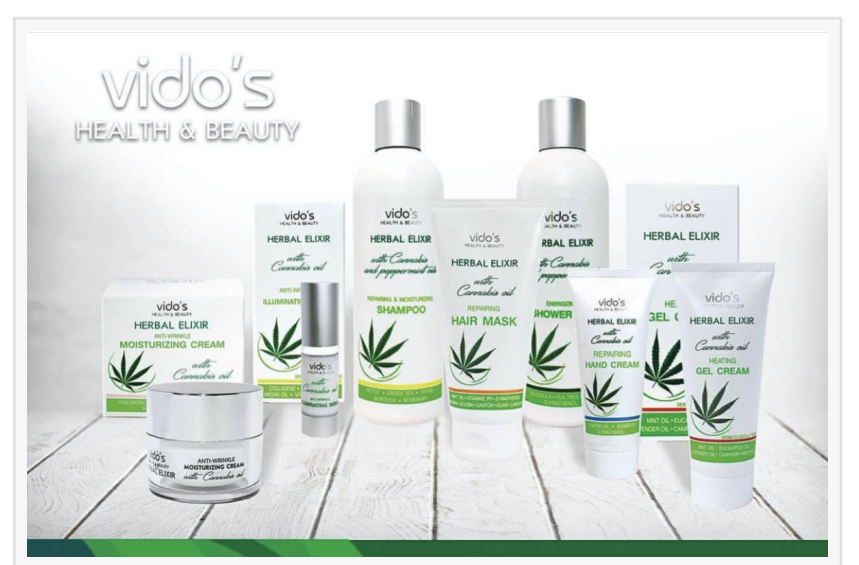
Vido's Health & Beauty USA is bringing Europeanquality, herbal skincare elixirs that use Hemp Seed Oil, vitamins, and other natural essential oils to the U.S.

"Your skin is under attack during the winter months," said Iva Plummer, one of the co-founders of <u>Vido's Health &</u> <u>Beauty USA</u>. "Your skin needs a lot of moisture and care to keep it looking radiant and healthy.