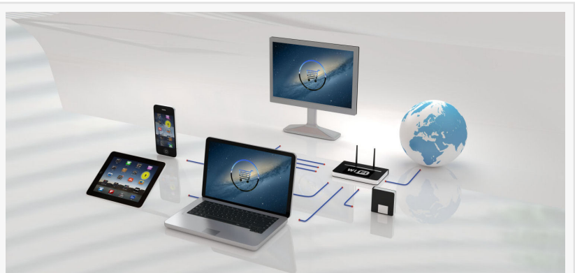
Mobile Ready Website Design

The newest websites are based on mobile interactions. The websites being created now are fast and informative. Websites need to be beautiful, informative, and well-structured but ... they also have to be REALLY FAST for mobile. Not only that, Glenn Website Design is now offering animations, roll-over effects, and much more. At Glenn's custom website design company, they will work with you to get you the best website design for your small business with high-quality modern web design at a reasonable price. They offer flexible set pricing, hourly rates, and monthly financing. Glenn's custom website design company is designed for small businesses but not limited. For a limited time only they are offering the small business website design , a $3,000