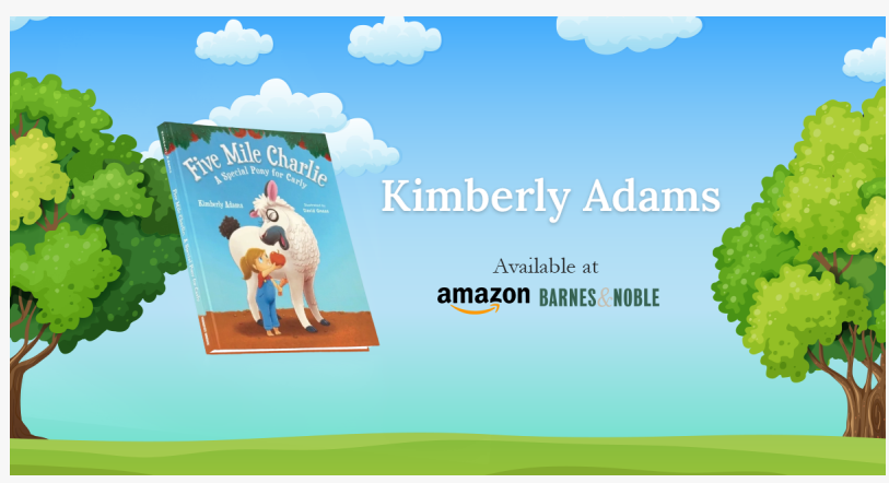
Five Mile Charlie: A Special Pony for Carly Available on Amazon and Barnes & Noble