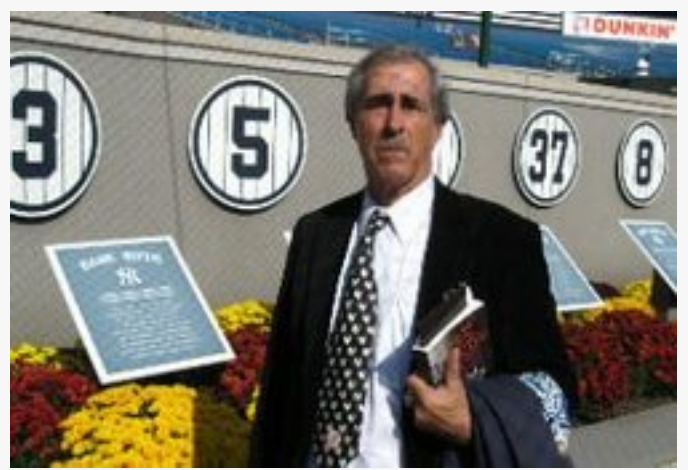
Author Peter Golenbock

This press release can be viewed online at: https://www.einpresswire.com/article/565596026