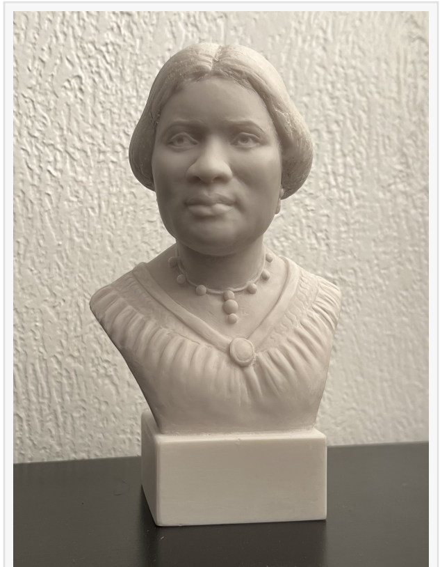
Madam C.J. Walker bust

The "SculptHER™ Collection, Telling Her Story Through Sculpture," pays homage to acclaimed women who changed the world with their prodigious contributions in the fields of science, civil rights, human rights, business, journalism, archeology, astronomy, aviation, the arts, sports,