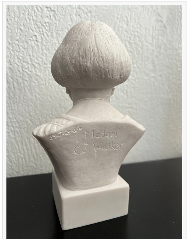
Madam C.J. Walker bust, back