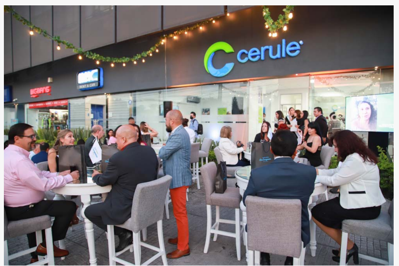
Loyal Cerule Family Members

I am incredibly excited at the future growth prospects for us all with our current range of products and those we shall introduce this year. We have a great support team in Mexico, who will also support our expansion into future Latin American markets later this year."