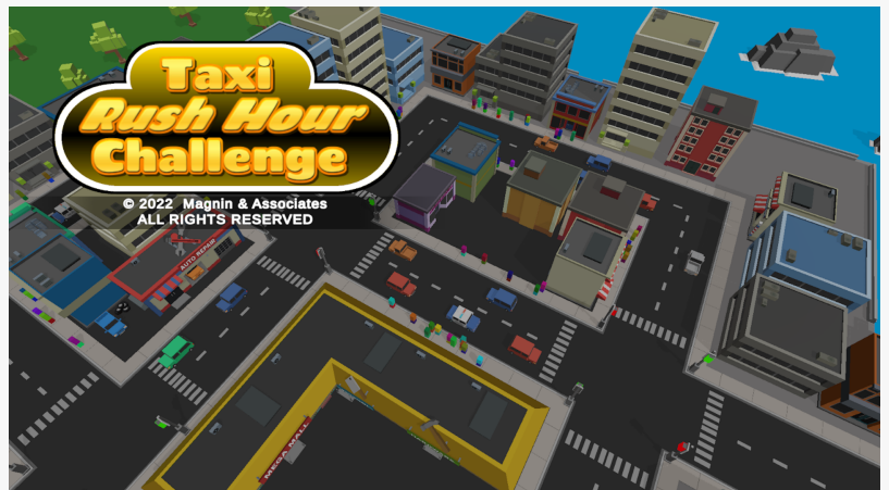
Taxi Rush Hour Challenge Title