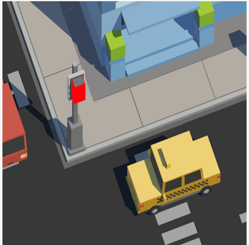
Taxi Rush Hour Challenge Icon

Universal App - supports iPhone, iPod Touch, and iPad, including standard, Retina, and iPhone X