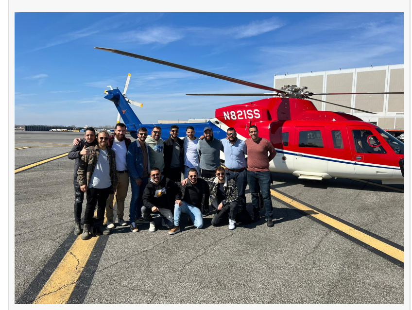
12 disabled IDF veterans who were wounded in action visit New York in a life-changing journey sponsored by Belev Echad

This week, this group of veterans were wined and dined in Manhattan's finest establishments, toured the Stock Exchange and Statue of Liberty, drove around in Lamborghinis and were treated to a luxury helicopter tour.