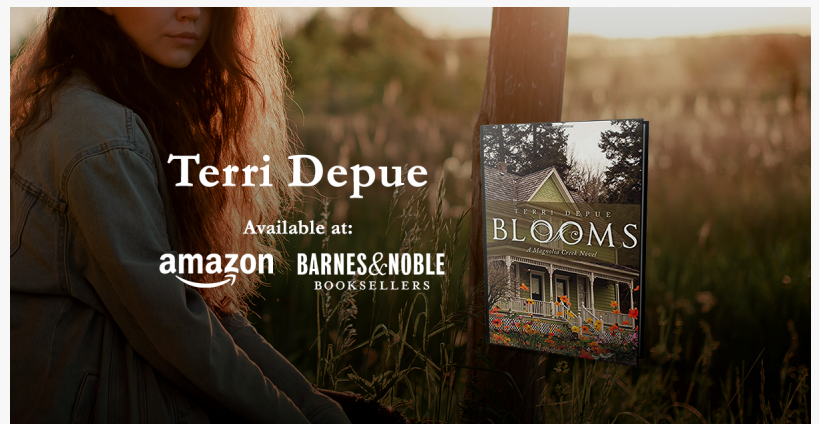
Blooms: A Magnolia Creek Novel Available in Amazon and Barnes & Noble