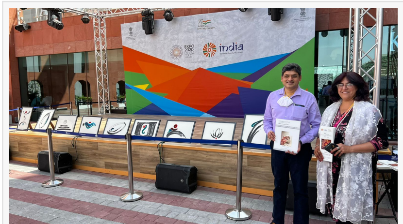
Chairman of Sapio Analytics and Assistant Director General of FICCI presenting the spiritual artworks

Last week, Dubai Expo 2020 saw invaluable artworks inspired from the ancient culture of India gracing the India Pavilion. With attendance from dignitaries around the world, the India Pavilion was able to present the cultural significance of India in establishing a global spiritual transformation.