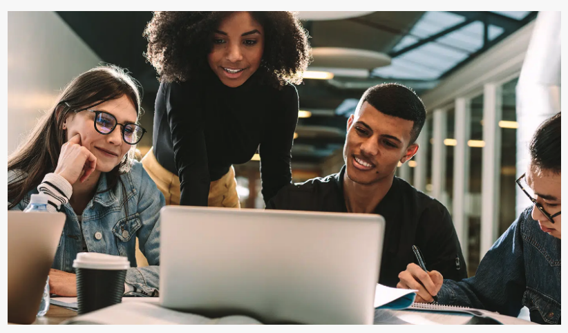
Almost 1/3 of U.S. workers under 40 are re-evaluating their careers and whether to pursue something else.

to take a long look at the ever-expanding IT field as to where they would want to land. Additionally, the IT field is recognized for offering in-demand, high-paying positions that don't