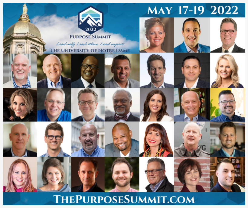
Purpose Summit 2022 Speakers

discussions designed for specific learning tracks including human resources, finance, marketing,