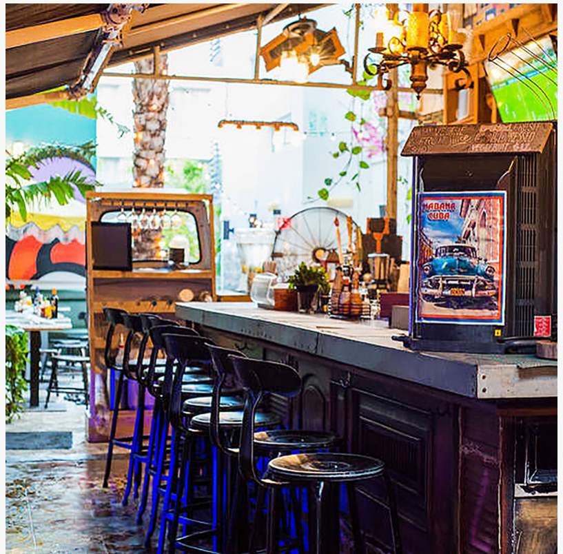
Mas Cuba Cafe & Bar