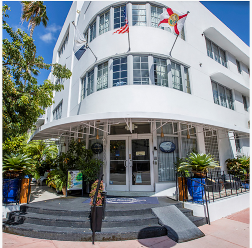
Riviera Suites South Beach

/EINPresswire.com/ -- Riviera Suites South Beach by South Beach Group Hotels is an all-suite hotel offering stylish accommodations ideal for a wonderful vacation, blending classic sophistication and contemporary chic; and is located just steps from famous Collins Avenue, the beach, the convention center, boutiques, restaurants, and nightlife. There is a courtyard pool with private cabanas, a breathtaking sundeck, and a rooftop pool with sweeping views of the city and the ocean. The suites feature fully equipped gourmet kitchens, separate living and dining areas with pull-out sofas, organic cotton pillow-top beds, and rain shower heads.