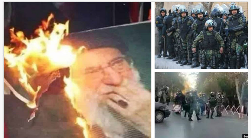
Defiant youth in Tehran and cities throughout Iran torched photos and effigies of Khamenei and Khomeini during Fire Festival Chants of "Death to Khamenei, death to the dictator, hail to Rajavi" State Security Force puts 20,000 on alert in Tehran alone.

Terrified of the youths' gathering, the regime's repressive forces closed Pardisan Park (one of the traditional locations for celebrating the Fire Festival) in Tehran.