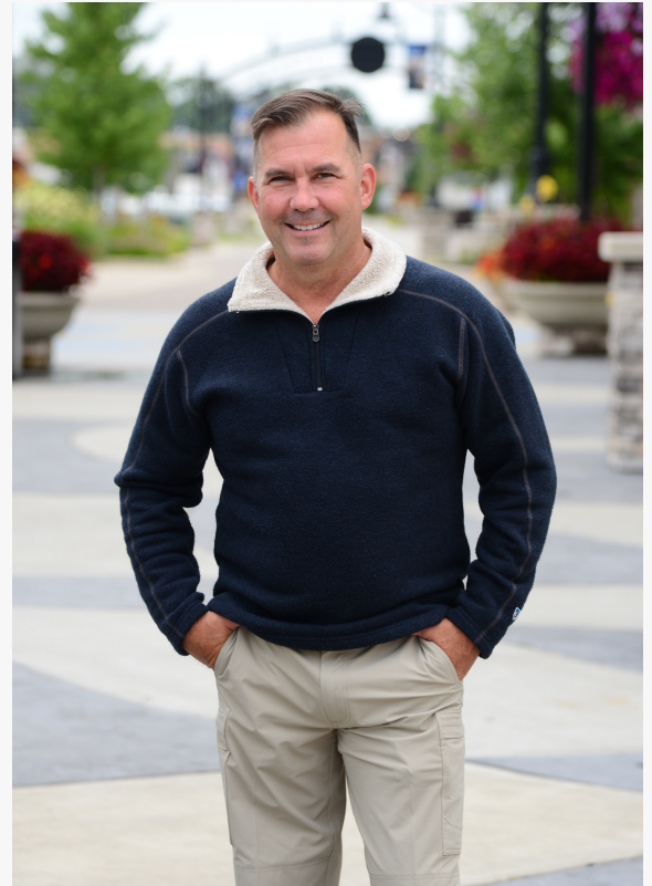
Michael Brown, Republican candidate for Governor

The full plan may be downloaded here: https://tinyurl.com/safemichigan