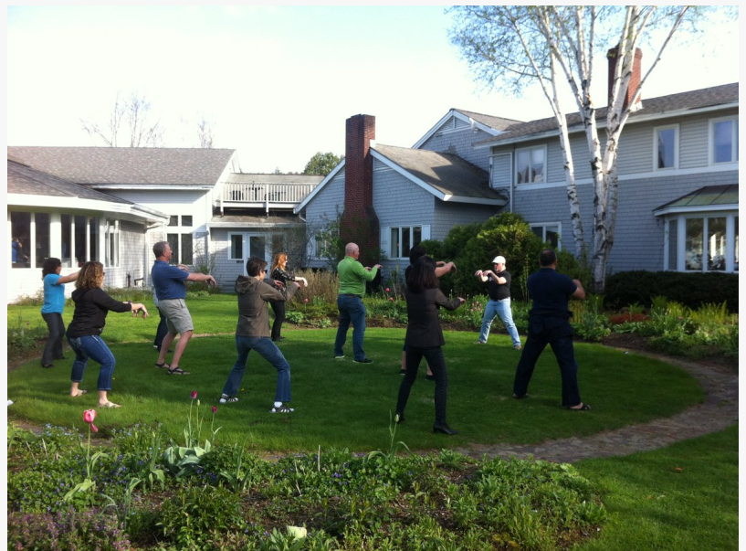
Morning Qi Gong at WWDVC before the sessions

This press release can be viewed online at: https://www.einpresswire.com/article/565719319 EIN Presswire's priority is source transparency. We do not allow opaque clients, and our editors try to be careful about weeding out false and misleading content. As a user, if you see something we have missed, please do bring it to our attention. Your help is welcome. EIN Presswire, Everyone's Internet News Presswire™, tries to define some of the boundaries that are reasonable in today's world. Please see our Editorial Guidelines for more information. © 1995-2022 IPD Group, Inc. All Right Reserved.