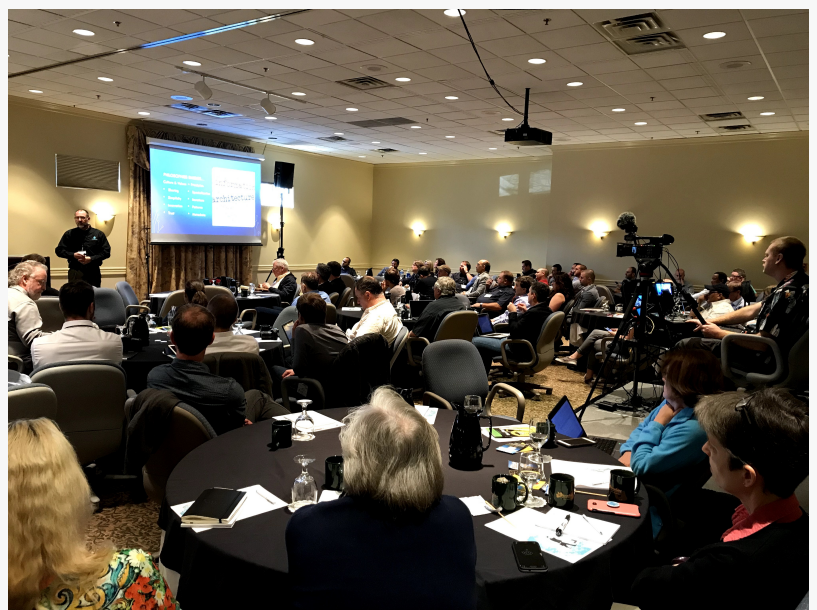
Attendees at a Session