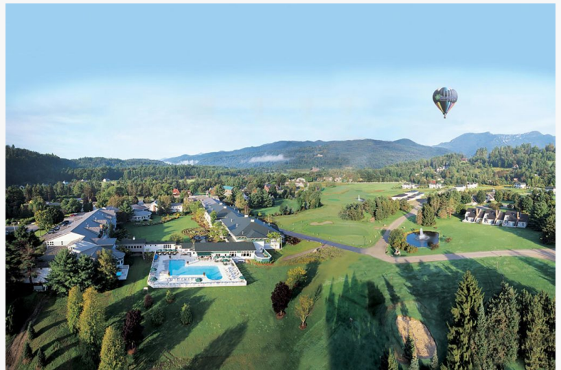
Stoweflake Resort and Spa