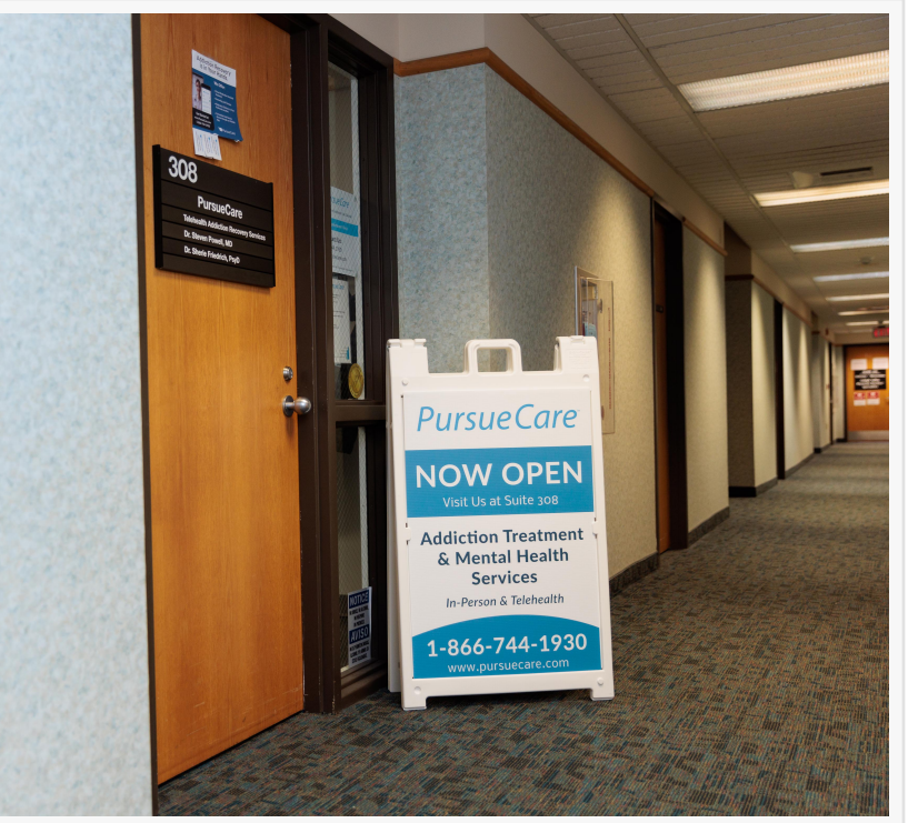
PursueCare's Allentown clinic exterior, located at Suite 308.

"The high health care costs commonly associated with people who use drugs are not for treatment they want or need," said Nick Mercadante, PursueCare's CEO. "Instead, because substance use is highly stigmatized, people fall outside traditional routes to better health and end up in a cycle, overutilizing high-cost ER visits and inpatient stays. These avenues rarely result in transition into long-term recovery options. The continuum of care between the 'front doors' for